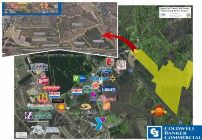
1000 Newman Road - Lightfoot, Virginia

COLDWELL BANKER COMMERCIAL BROOKS REAL ESTATE