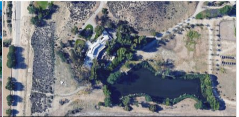
Westfield Ranch - Temecula, California

http://www.cbcsocalgroup.com/ 951-200-7683