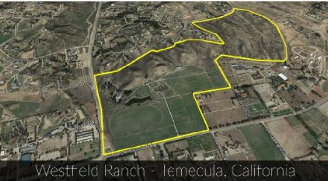
Westfield Ranch - Temecula, California