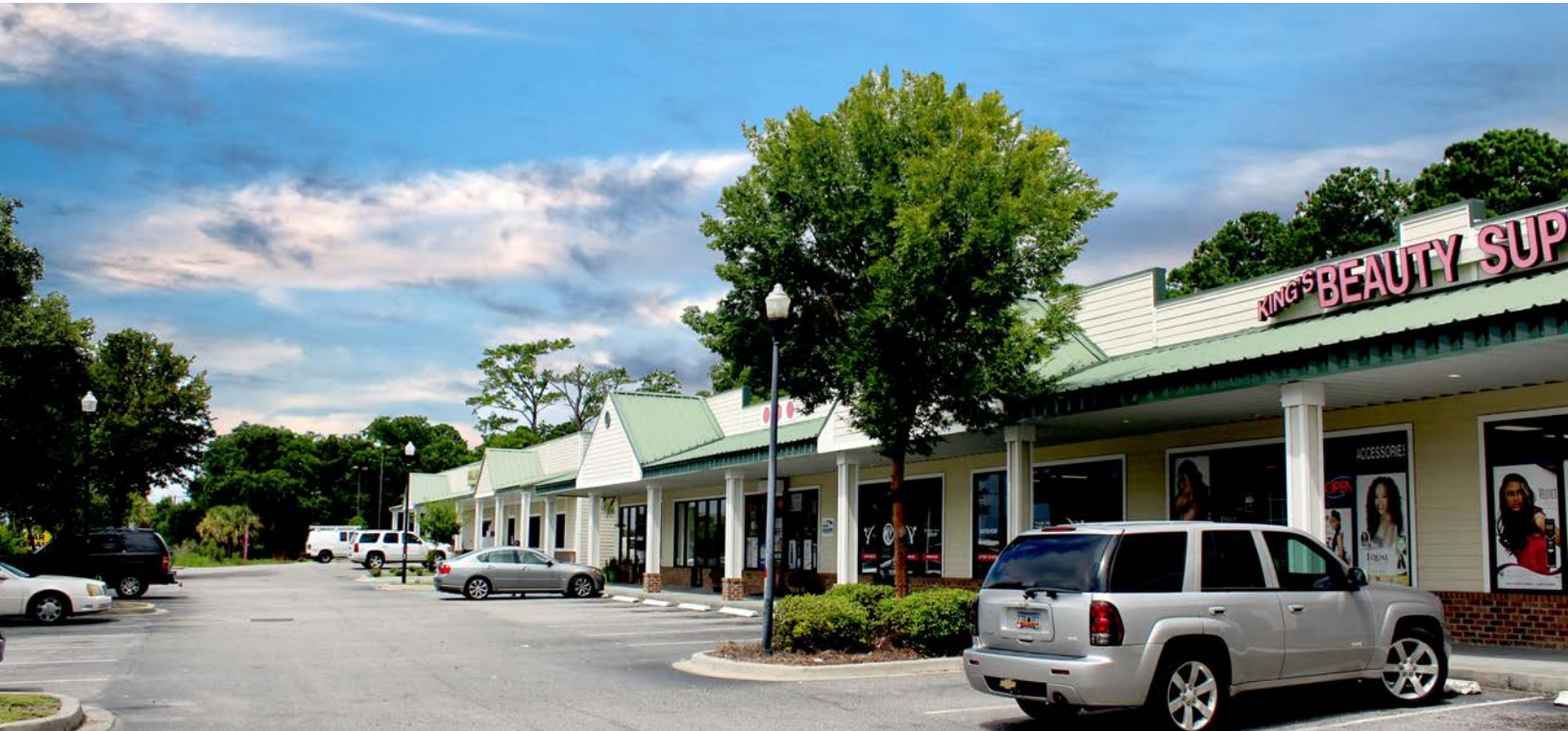
Red Top Village