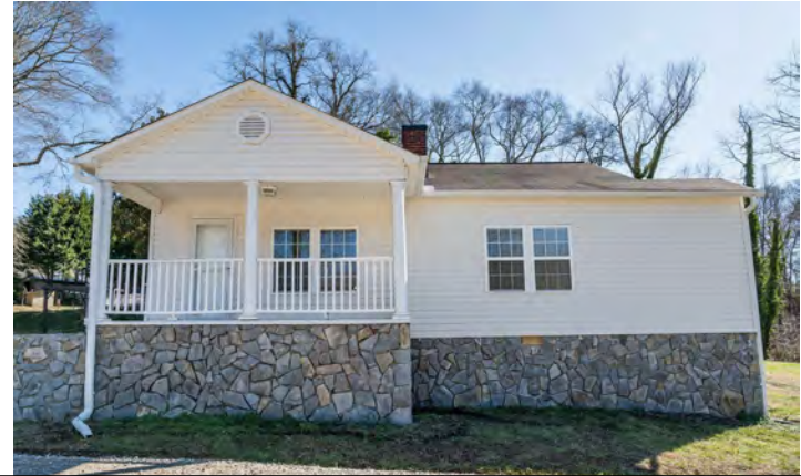
3997 Country Club Rd.