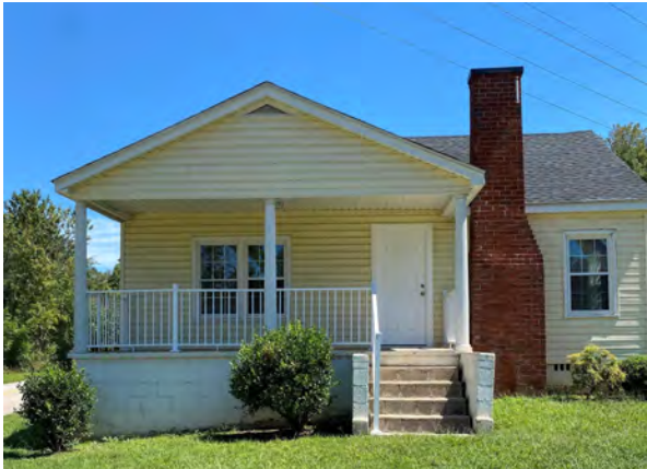
3995 Country Club Rd.