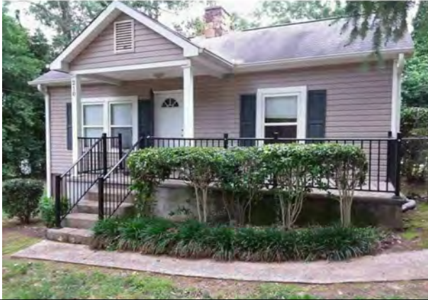
210 Hilton St.