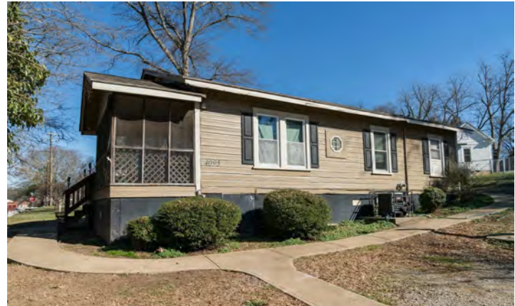
4095 Country Club Rd.