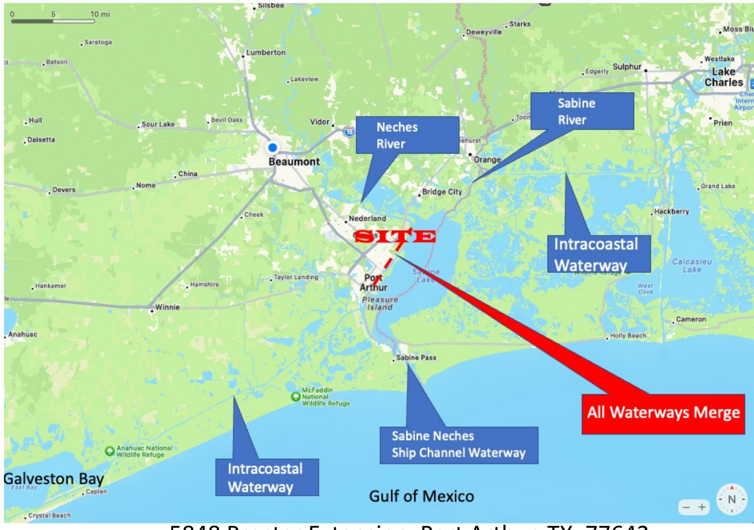
5848 Procter Extension Port Arthur, TX. 77642