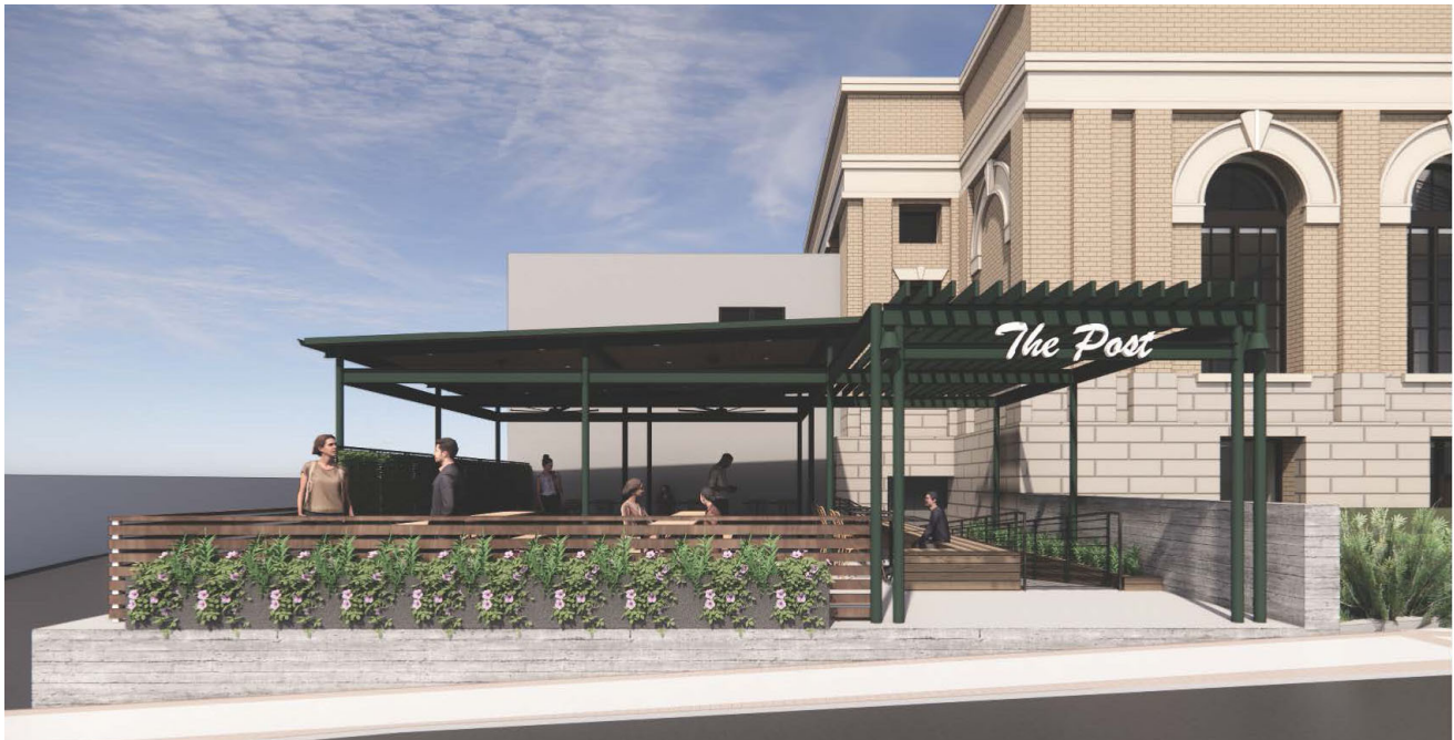
ENTRY TO SUBJECT SPACE FROM COVERED PATIO