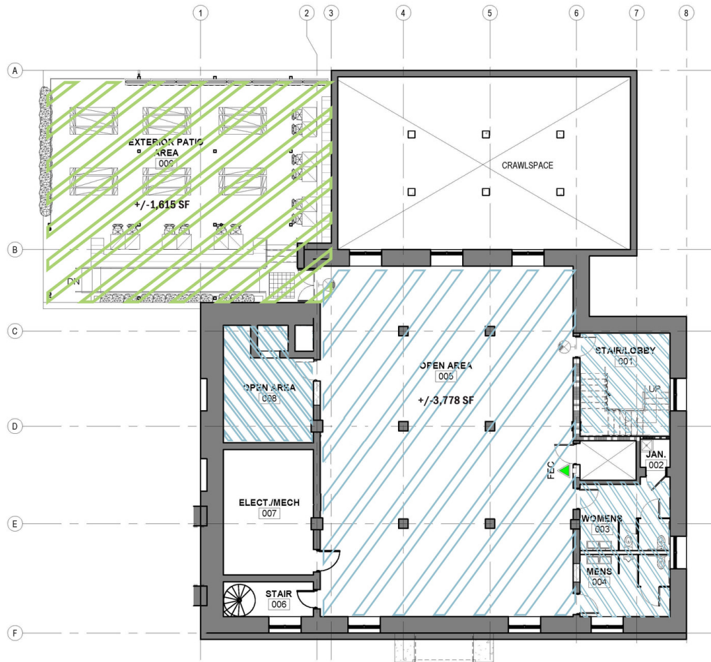
1 LOWER LEVEL FLOOR PLAN 3/32" = 1'-0"