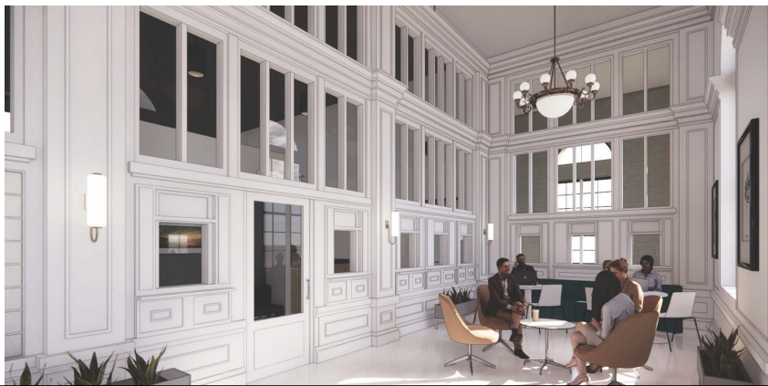
OFFICE ENTRY LOBBY FROM MAIN STREET