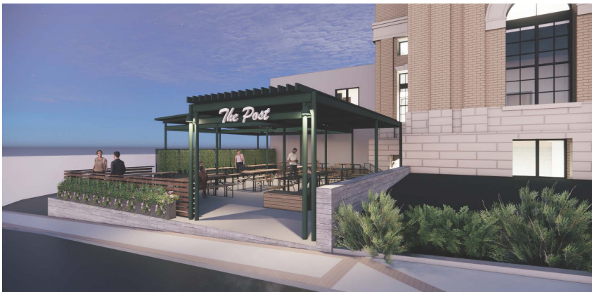
PATIO VIEW FROM CORNER OF FEDERAL STREET AND MAIN STREET