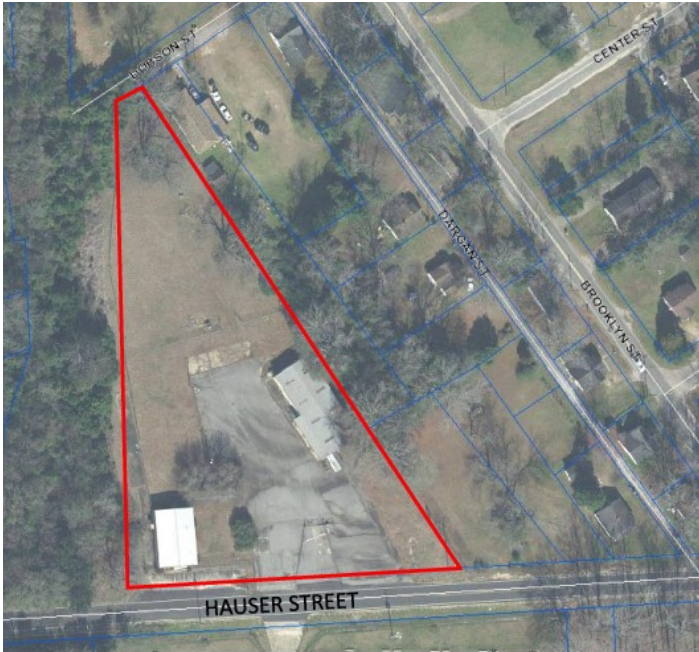
Property Aerial View